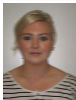
X picture blurred