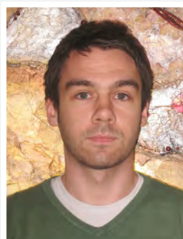
X background too busy

Please note that photographs become part of our official records. We will not return them.