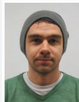
X no hats