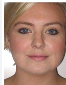
X too close