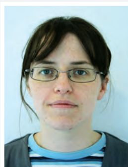
✓ correct photo